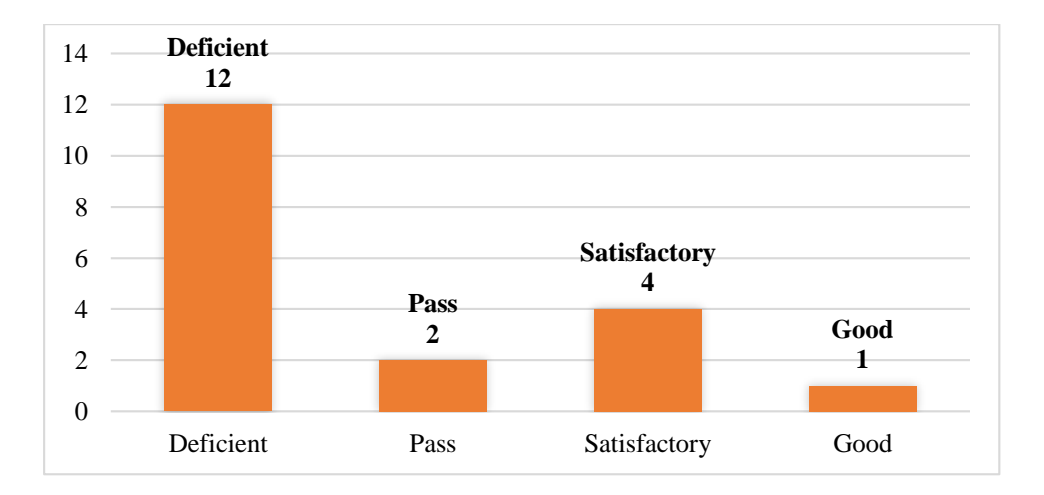
Figure 2 A2 level category posttest

to the minimum value, and denoting that the controlled use of Kahoot! for incrementing the Reading for Detail subskill performance results accounts as a consistent tool.